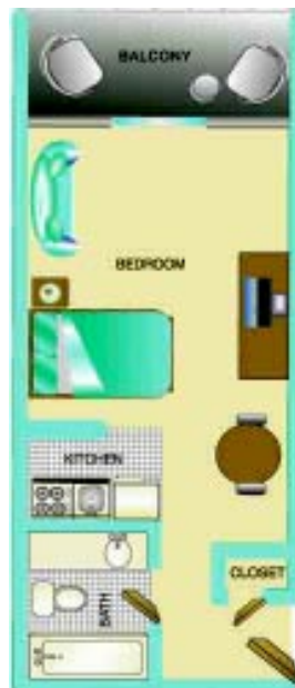
Oceanfront Style C Corner unit layout, pre-renovation.

NOTE: Double/Double and King illustrations are an artist depiction of a future renovated Landmark Phase II typical unit, post renovation. They are not to scale and are not intended to be specifically accurate. The developer reserves the right in its sole discretion to make changes or modifications to plans, specifications, materials, features and colors without notice.